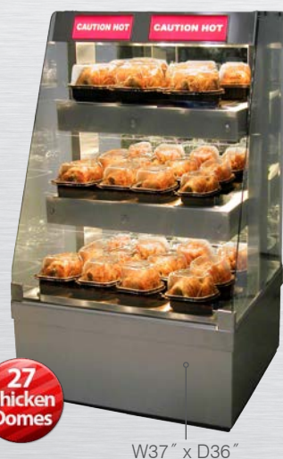
3-Tier Zone 3